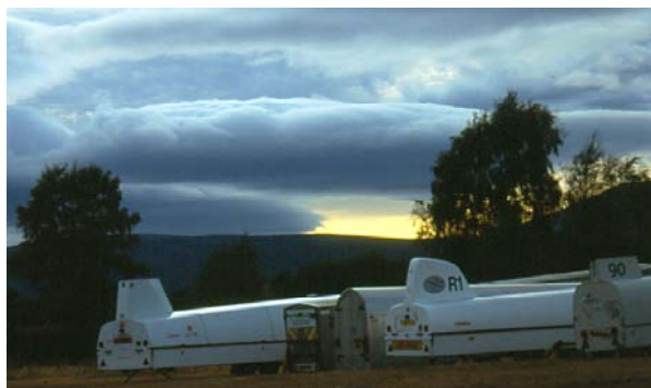
Glider trailers at Aboyne, Scotland (Diana King)

Europe Air Sports takes the view that proven safety data must demonstrate if, how, and to what extent inspections of light trailers might improve road safety.